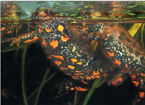
Fig. 6. Bombina bombina . Colouration of individuals in an outdoor enclosure

offered simultaneously the toads usually preferred the latter. Unconsumed or dead food is eaten by snails. Hence, a certain number of snails is considered useful.