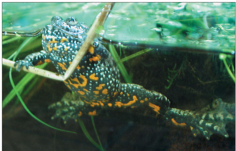
Fig. 5. Bombina bombina . Typical colouration of laboratory individuals

During the cold season, when most of these animals are not available in IR Land, we buy Acheta sp., Gryllus sp., Drosophila sp. or Musca sp. from a zoo shop. However, as soon as possible we collect food animals in IR Land. When zoo shop food and IR land food were