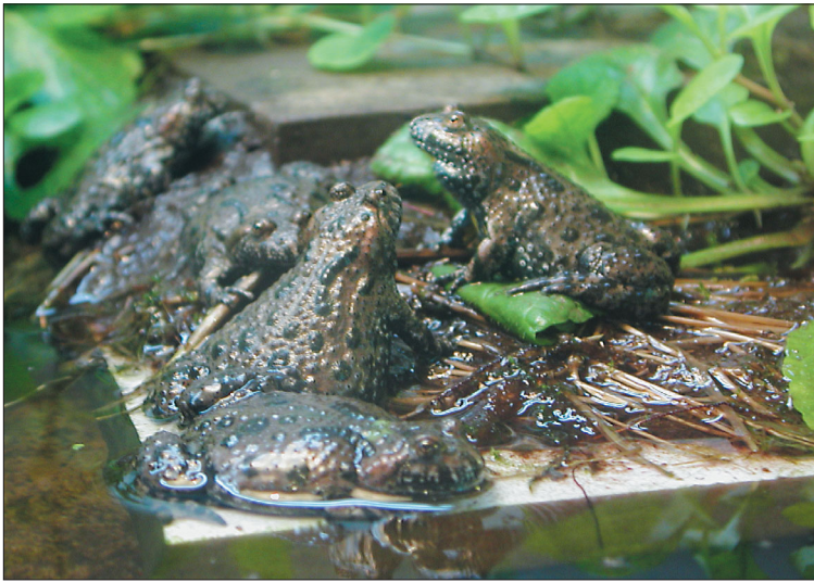
Fig. 4. Bombina bombina . 8 days after 'wake-up'. The toads aggregate underneath a light source forming clusters

trated in Figs. 2 & 3. It consists of glued-together glass plates (150 cm × 60 cm × 60 cm high). The cover features a firmly attached back plate and 2 movable front plates. Each of the front plates can be slid back (by glued-on handles) in tracks, tightly fitting over the back part. Pushing back both front plates makes the whole interior of the enclosure easily accessible. For air exchange the upper part of the back plate and the upper parts of both side plates carry perforated metal sheets measuring on both container sides 60 cm × 15 cm; on the back side: 150 cm × 15 cm (Fig. 2). The perforations in the sheets have a diameter of 2 mm.