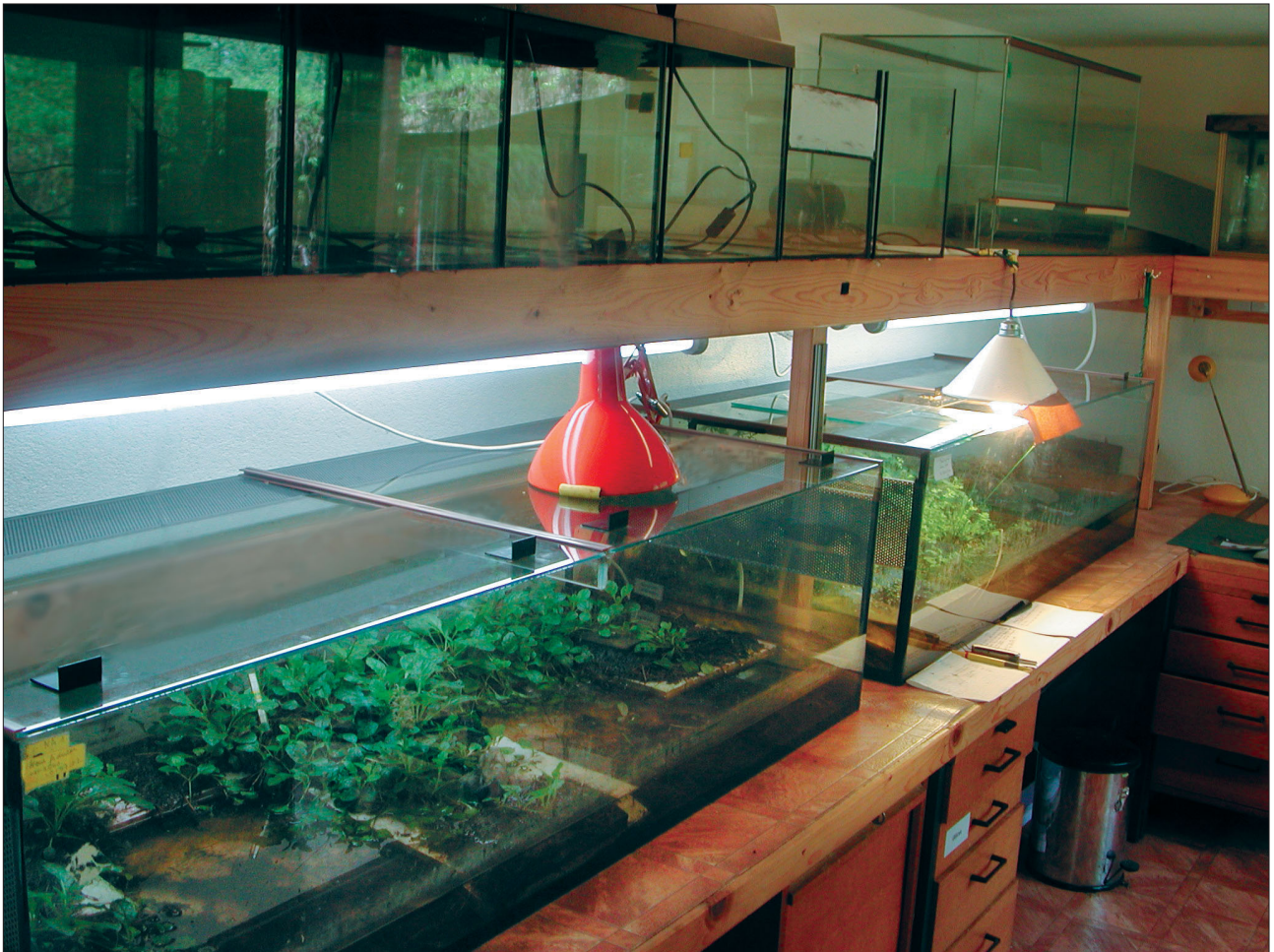
Fig. 3. Arrangement of breeding enclosures in Laboratory 2

ture control failed for 1 or 2 days and, at -4^{\circ}\text{C} , all toads in the box died. We have also placed the plastic boxes in a large walk-in freezer. In all cases—except for the temperature-control failure—100% of our over-wintered toads survived.