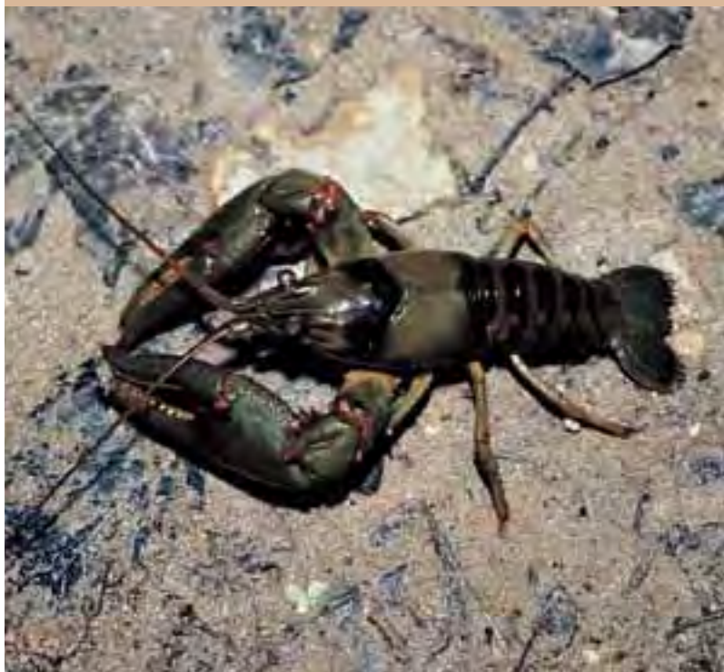
Tom R. Johnson

Hellbenders need cool, clear, unpolluted waterways with large rocks and riffles to live, such as the Big Piney River (far left) and the Jacks Fork River (bottom). In such waterways, hellbenders seek both shelter and their main food source, crayfish (below).